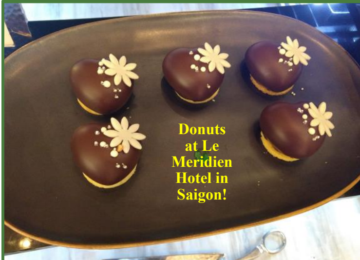
Donuts at Le Meridien Hotel in Saigon!

After a quick class on negotiating with the locals we will turn you loose to purchase, lacquered items, pearls watches, and clothing!