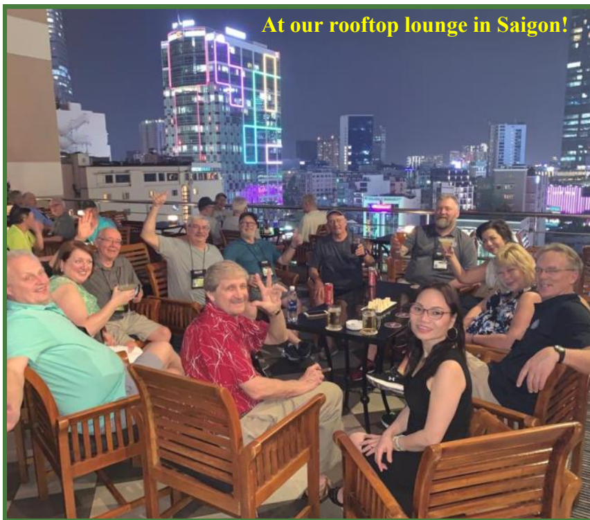
At our rooftop lounge in Saigon!

Military Historical Tours (MHT) is offering this special trip for Friends and Families who would like to shake off the cobwebs and hit the road on this once in a lifetime trip to Vietnam. Explore places like Saigon, Cu Chi, Dong Tam, Da Nang, An Hoa, Quang Tri, An Khe, Pleiku, Route 9, Tay Ninh, China Beach, Hanoi, the Hai Van Pass , and many, many more. Travel with our experienced Historians and Tour Directors and MHT will handle all of your travel arrangements from the closest Airport in your home state to Vietnam and back home.