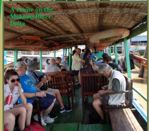
A cruise on the Mekong River Delta